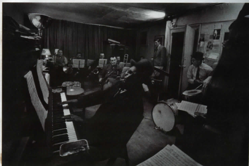
From W. Eugene Smith's "The Jazz Loft Project," an image of Thelonious Monk and his Town Hall band in rehearsal, February 1959.

Alfred A. Knopf. The Center for Documentary Studies also teamed up with WNYC, a radio station with National Public Radio, to produce a radio series about Smith's historic jazz recording. You can listen to the radio series, and learn more about Smith's life, work and his recording techniques through a link on the Jazz Loft Project Web site.